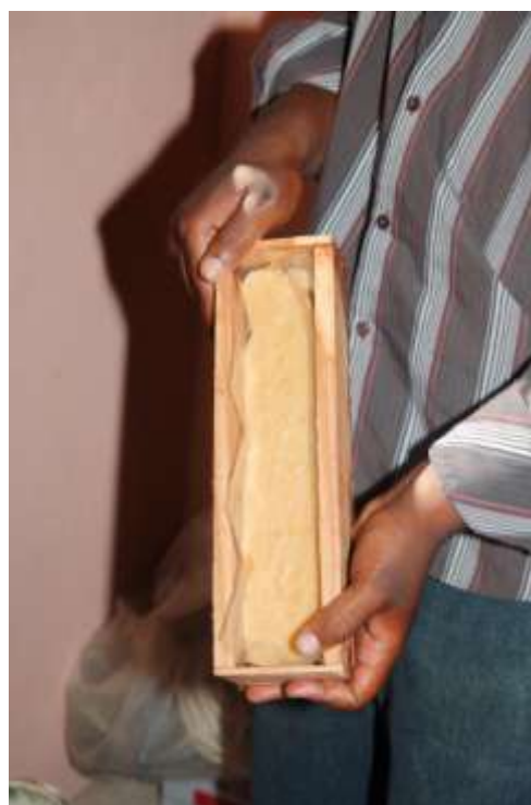
Figure 20 Jatropha soap production. Small molds like the one shown here are used for experiments.