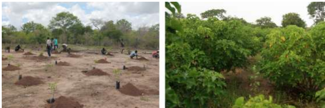
Figure 25 Growth of Jatropha in 17 months in Mozambique.

In Mali, yields of around 500 kg/ha after 2-3 years are reported for low-input agriculture. These figures appear to be from fields with good production and the average production is not known.