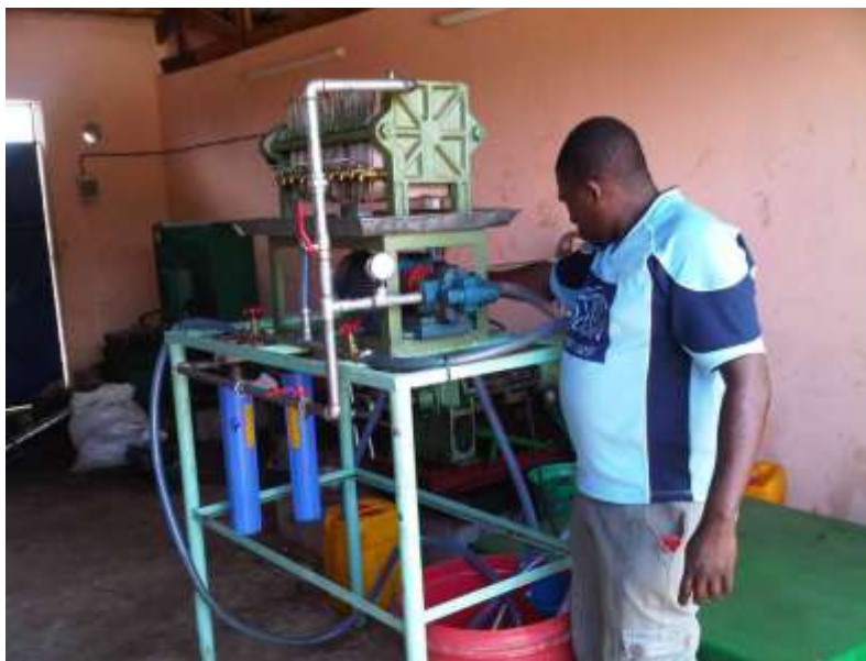
Figure 17 Filtering Jatropha oil, Bilibiza, Mozambique.

The most simple and appropriate method to purify the pressed oil is only by sedimentation and filtering. For small-scale projects like in MMH, drums (Mali & Honduras) or handmade