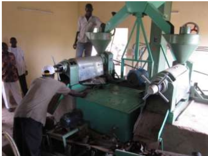
Figure 15 Oil pressing in Mali.

Availability of dealers and spare parts within the regions is important too. Based on all the above considerations the following presses were identified as good options: the Sayari expeller or the 6YL-80; the 6YL-95 and 6YL-125 (DoubleElephants). For both Mozambique and Mali a Sayari press was bought as well as Double elephant presses.