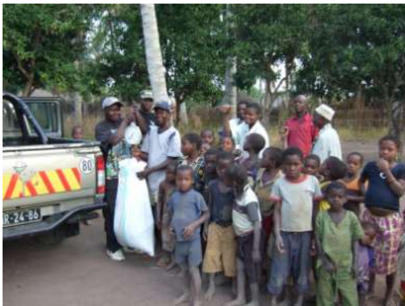
Figure 26 Jatropha being collected.

In Mali and in particular Honduras, infrastructure is better and production per farm is higher, so their transport costs are likely to be lower than in Mozambique.