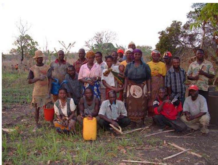
Figure 24 Farmers Club at Nanjua, Mozambique.

Due to the non-mechanised shifting cultivation agriculture in the area, labour is the major limiting factor. Land is still abundant for the time being. The population density is however growing so fast that shifting cultivation will