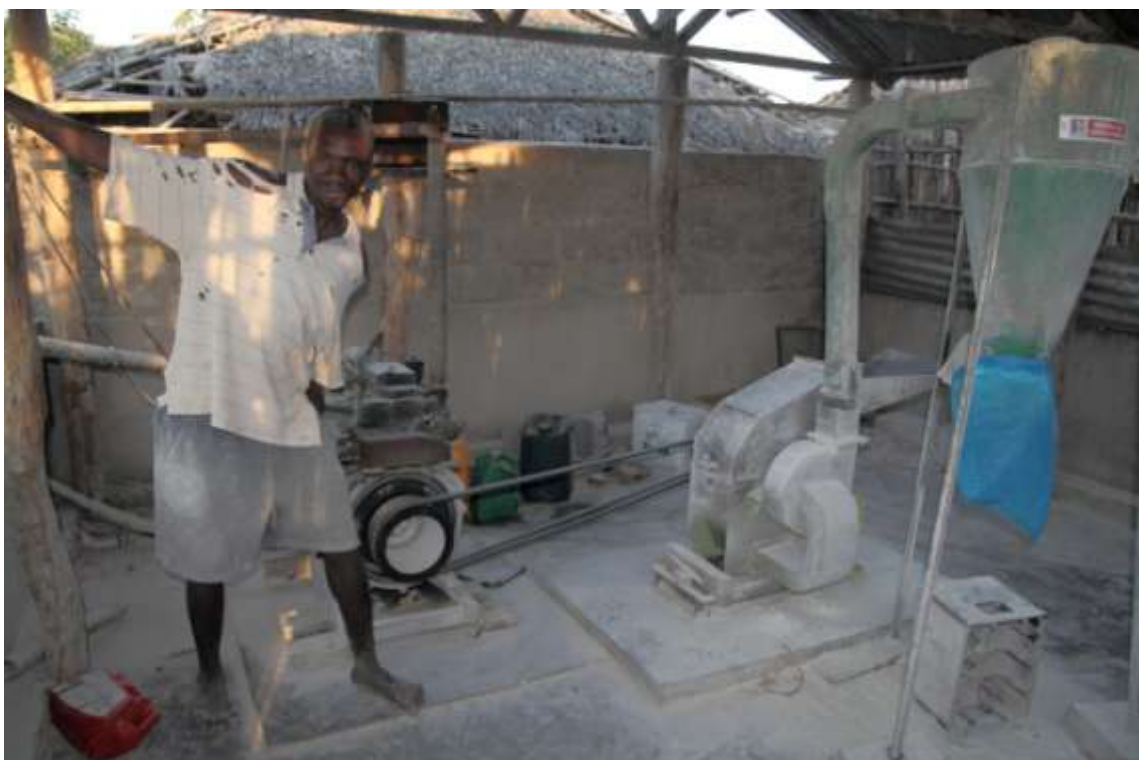
Figure 4 Local maize mills like this one can be converted to run on Jatropha oil.

Currently a "prototype" value chain is in place. All problems ranging from seed pre-treatment at one end to the effect of using JPO in diesel engines was researched and solutions were found for the problems that cropped up. The value chain works technically, but it remains fragile. At the end of the project, it looked as if it could be both profitable to the farmers and to the processing plant (BBC), but it will take at least a few years before firm conclusions on this can be reached.