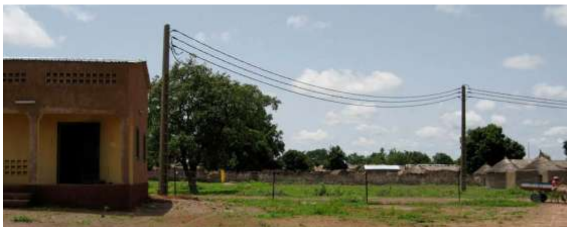
Figure 2 The power house and the start of the grid at Garalo Mali.

The project was set up by the Mali Folke Centre in June 2006, and planted 530 ha of Jatropha in different villages in the commune of Garalo, mobilising 430 producers.