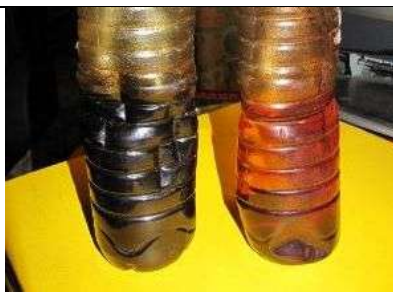
Fig 2 Cotton oil, before treatment left, acidity 20.4 after treatment right, acidity 0.08.