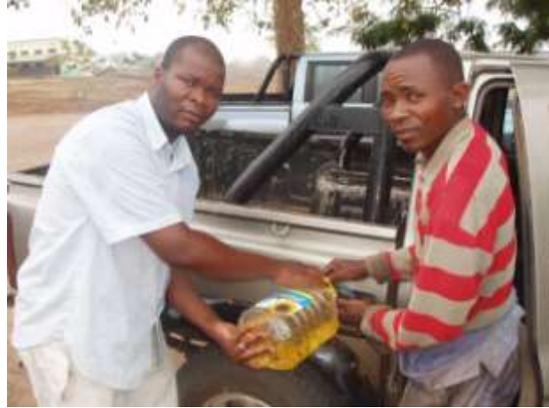
Figure 19 Fueling the modified Nissan in Mozambique with cooking oil.