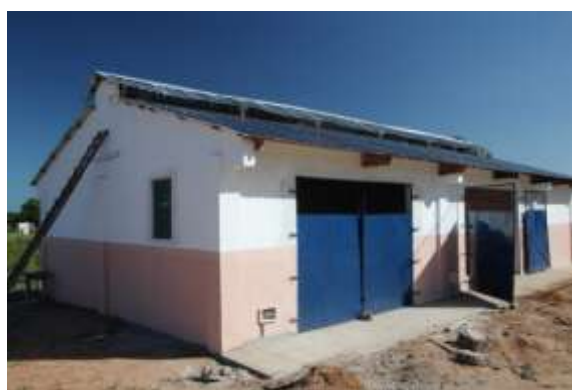
Figure 16 The BBC Jatropha Processing Plant in Bilibiza, Mozambique.

From operational experiences of a number of other users of Double elephant presses in Mozambique, it was found that these presses could be maintained and they performed well. The industrial quality standard of both the Sayari and the Double elephant is not high. The Vyahumu trust could not supply certificates of the material of the screws, and the finishing of the screws is only by grinding, and no polishing is done (de Jongh, visit to Vyahumu in 2008). The Double elephant screw has been well-polished, but no certificate of material