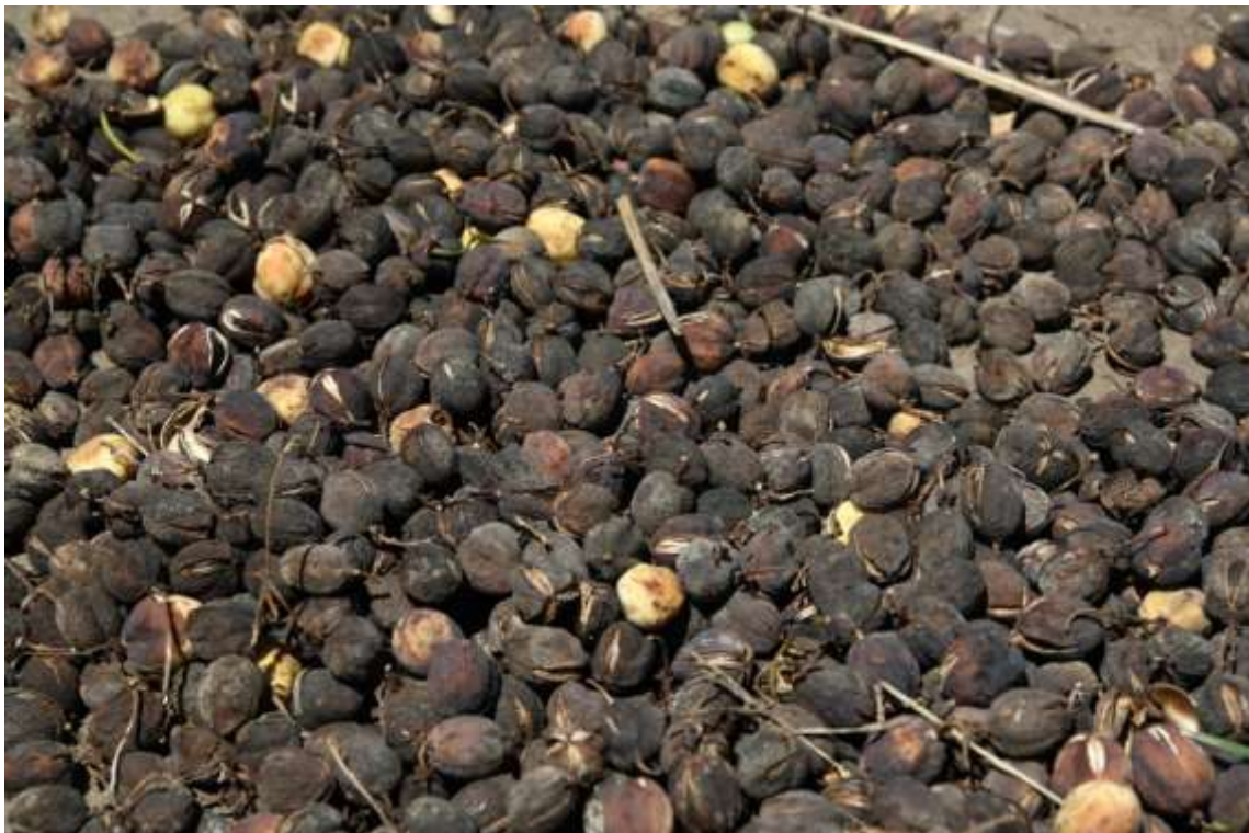
Figure 27 Jatropha seeds spread on the ground for drying.

PPO that does not meet the quality requirements for engine fuel is used for soap production which is currently more profitable than biofuel. Other oil-based products that are planned include laundry detergent, luxury soap, shampoo, shower gel, disinfectant and mosquito repellent. The target for a number of these products is the urban market in Pemba.