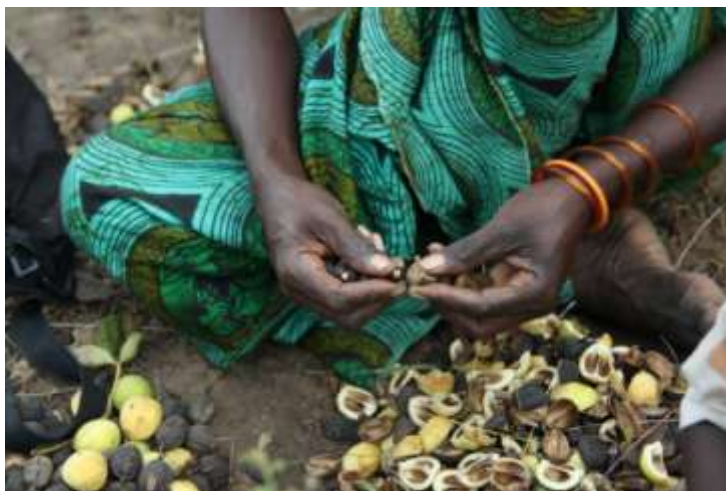
Figure 12 Farmers in Mozambique deshelling Jatropha seeds by hand before drying them.