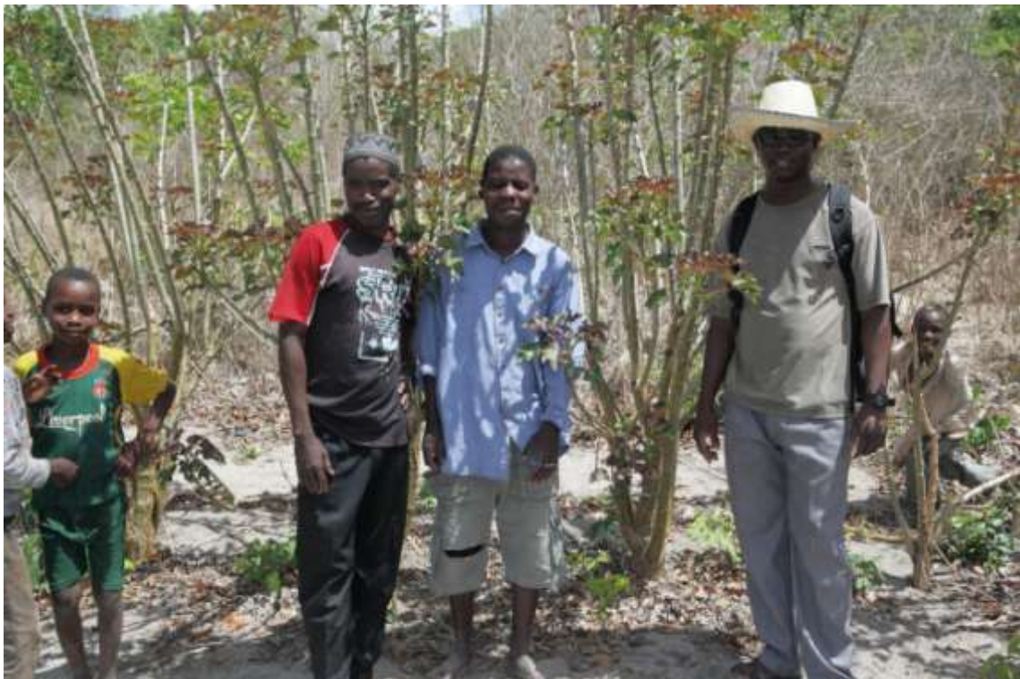
Figure 3 Farmers in front of their Jatropha hedge in the dry season.

The project area is located in the coastal zone of Cabo Delgado Province in an area with a population density below 18 people/km 2 . The population is 76% Muslim and 72% belongs to the Macua tribe.