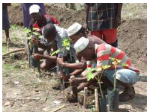
Figure 8 Jatropha hedge being planted in shallow soil in Mozambique. Notice the trench to catch surface run off.

In the Mozambique project area, farmers are increasingly changing from scattered plots separated in the forest to “block” farming where a village locates all its fields adjacent to one another. This reduces the perimeter that must be guarded around the clock against wild animals during the