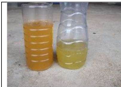
Fig 1 Jatropha oil, before treatment left, acidity 17, after treatment right, acidity 3