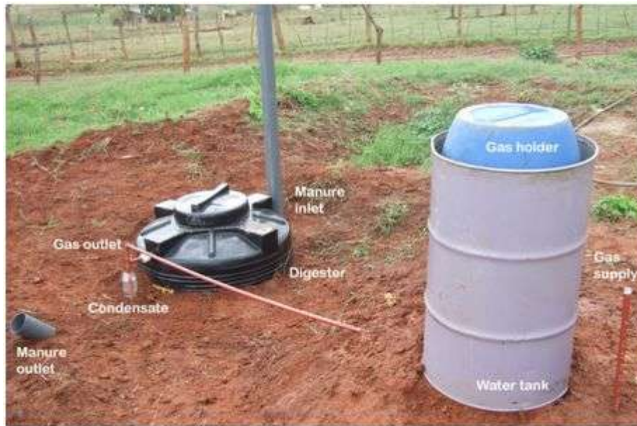
Figure 21 Demonstration biogas system established by the project in Mozambique.