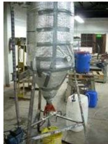
Figure 13 Bio-diesel installation, Gota Verde, Honduras.

Much work remains to be done on optimising all steps involved in conversion and application. Standardisation of for instance conversion kits for diesel engines is essential for bringing the costs and required skills level down but remains elusive as long as the Jatropha sector stays small.