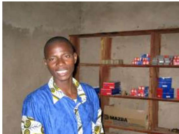
Figure 23 Shop with Electricity hardware items in Garalo.

In the Mali project, farmers are out-growers. They have no share in the oil-processing unit, which is run by a separate organisation, namely the Bagani Co-operative, set up by the MFC. A building for pressing and refining has been constructed. From the project closure (December 2009) until present, Jatropha oil has not been produced.