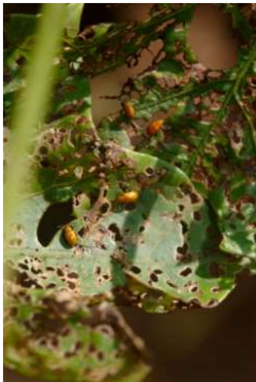
Figure 11 Yellow flea beetles attacking Jatropha in Manica Province where the conditions for Jatropha are sub-optimal.

A few golden flea beetles and rainbow shield bugs can sometimes be found, but the damage is insignificant. Termites are the most destructive pest. During the dry season, they will sometimes eat all the moist tissue the whole way around the stem, thus killing the plant that soon falls over. This appears to happen mostly to plants that are stressed; e.g. growing on soil saturated by water during the rainy season or on exhausted soils. In other cases, termites have made mounds around Jatropha plants without harming them at all.