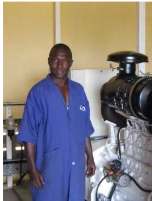
Figure 14 Technician standing in front of one of the Deutz generators, Garalo, Mali.