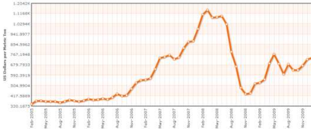
Figure 7 Crude palm Oil (CPO) price development 2005-2009, in USD per MT

During the preparatory stage of the project, Crude Palm Oil (CPO) was identified as a viable alternative to start biodiesel production. CPO prices almost tripled in 2007-2008. In the second half of 2008, in response to the worldwide recession outbreak, prices fell back again. In 2009, prices started climbing again to historically very high levels.