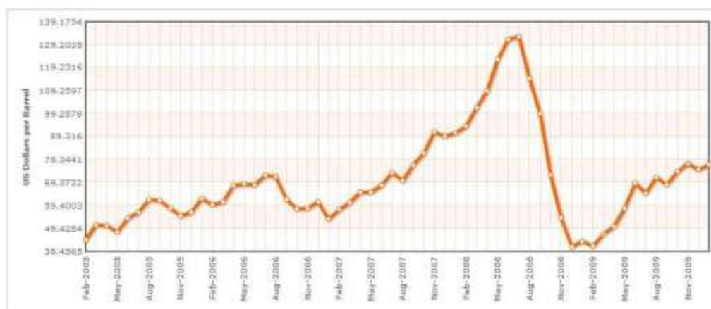
Figure 6 Crude oil (petroleum), price development 2005-2009, in USD per barrel.

As a result, production costs of PPO and biodiesel became higher than pump prices. Virtually all biodiesel producers in Honduras stopped producing. In 2009, oil prices started climbing again.