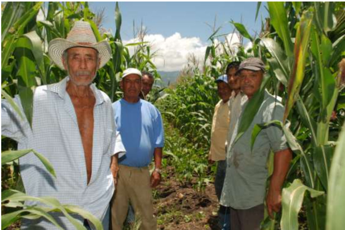
Figure 5 Farmers with their Jatropha intercropped in maize.

Yoro Province, with its capital of Yoro, is one of the 16 provinces (“departments”) of Honduras, located in the north of the country. The province consists of 11 municipalities, of which the project covers 8. Yoro province has an estimated 350,000 inhabitants, with a population growth of approximately 2.5% per year. Yoro is also the province with the third highest rate of emigration to the United States, a clear indicator of the lack of economic opportunities in the region. 43% of the province’s population lives in rural areas. The main economic activities in the intervention area are wood exploitation (including much illegal activity), cattle rearing and the cultivation of basic grains (maize and beans). Remittances from family members working in the U.S. form an income source of growing importance.