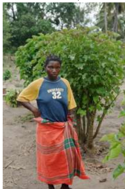
Figure 22 Farmer in front of a two year old Jatropha plant.

Both men and women were engaged in Jatropha production. The low requirements of Jatropha make it easy for even the poorest farmers to cultivate.