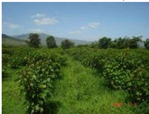
Figure 9 Jatropha plot in Honduras.

In Mozambique, farmers prefer much wider spacing in the Jatropha hedges than recommended by the project. The average spacing is 1.6m whereas the project recommended 30cm or less. Dense hedges are common in West Africa where they are used to keep chickens and small livestock out of the fields. In the project area in Mozambique, farmers do not plant hedges for this purpose but solely to demarcate field boundaries. Also, the main pests are elephants, wild boars and monkeys, which are unlikely to be deterred by a dense Jatropha hedge. Due to the wide spacing, the Jatropha plants experience little competition and have a good per-plant yield compared to what would be expected from dense hedges. The amount of planting material relative to the yield is optimised in this way; this makes sense because the farming systems are labour-constrained. The yield per meter is probably lower, but