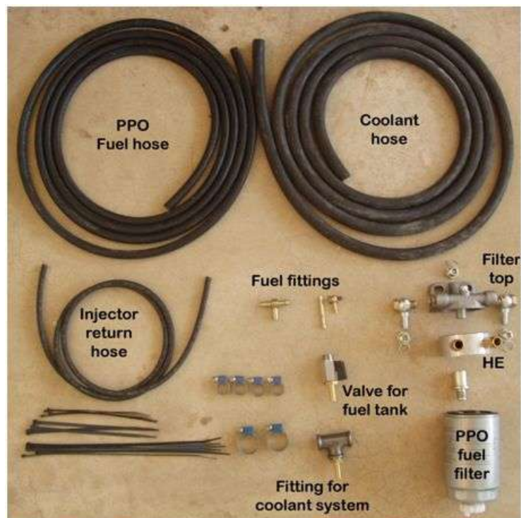
Figure 18 The parts of the modification kit

For the Mali project, three diesel engines were modified. The three Deutz (100kW) engines for the electricity plant in Garalo were modified with a 2-tank system. These engines have not yet run for a long time on PPO, since no Jatropha oil is available (at least one of the gen-sets was running on PPO for the inauguration, but after that there have not been seeds available). They have not yet been tested on vegetable oil with high acidity contents, but long-term testing on PPO is expected to be completed in 2011.