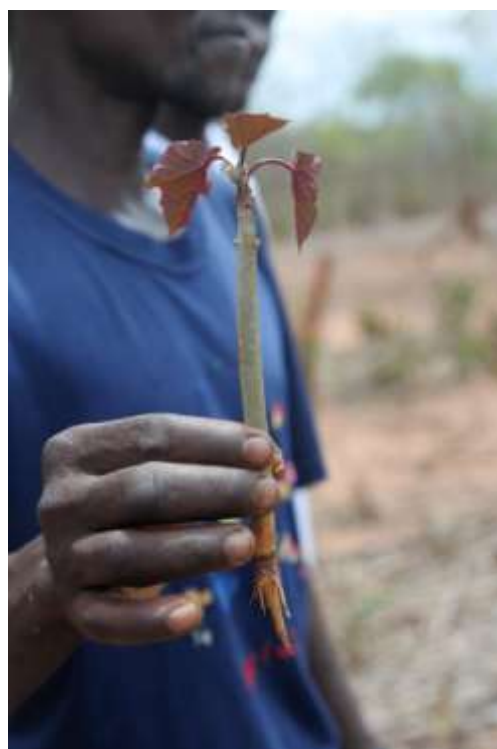
Figure 10 Wildlings like this one is popular with farmers for easy propagation of Jatropha .

In Mozambique and Honduras, it was also observed that shade is not required in nurseries. Moreover, direct sunlight on the emerging plants creates hardness and resistance in the plant material. However, the frequency of watering must be increased when no shading is used. Many Farmers' Clubs constructed nurseries under big shade trees to avoid having to maintain shade roofs. In Mozambique, Elaion Africa Ida experimented extensively with bare-rooted seedlings and found they performed well. Since poly bags are expensive and hard to find, this represents a significant advantage. Furthermore, it makes transport much easier. Particularly where seedlings have to be transported long distances by bicycle and foot, this is an attractive option.